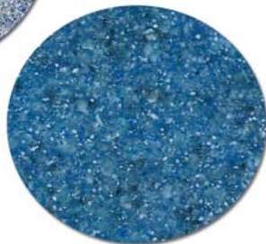
Hawaiian Ocean SGP 741