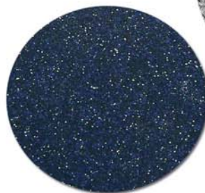
Deep Water SGP 760