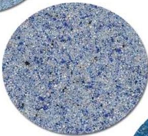
Blue Surf SGP 735