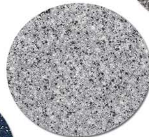
Stone SGP 260