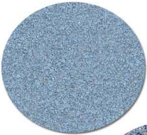
Maui Blue SGP 733