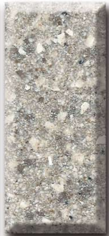
SGE 348 Rocky Trail

Get the large aggregate look of Engineered Stone or Natur