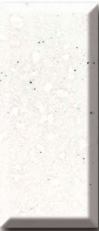
SGE 213 Snow Drift