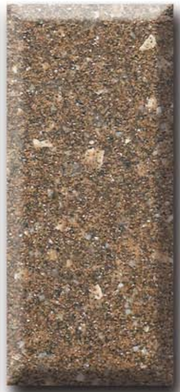
SGE 845 Cayenne