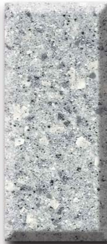
SGE 263 Moonscape