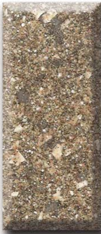
SGE 386 Hazelnut