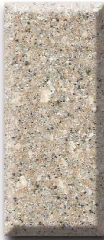
SGE 317 Clam Shell