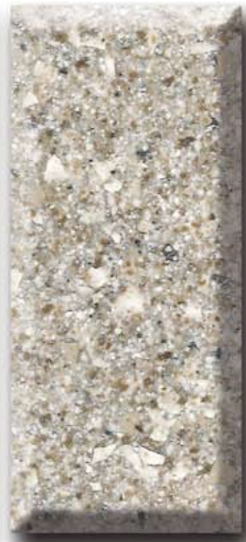
SGE 311 Latte