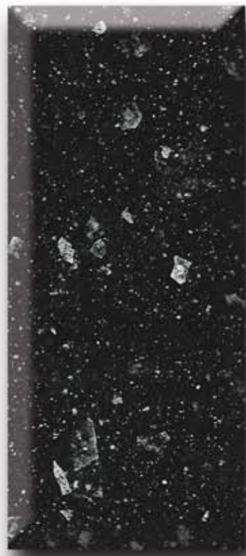
SGE 425 Milky Way