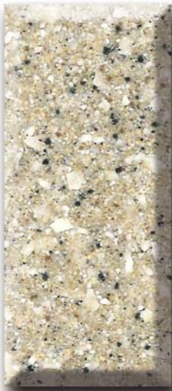
SGE 361 Maize