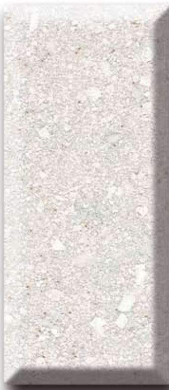
SGE 217 Cotton Wood NEW!