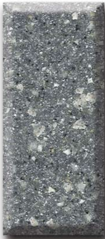
SGE 245 Boulder