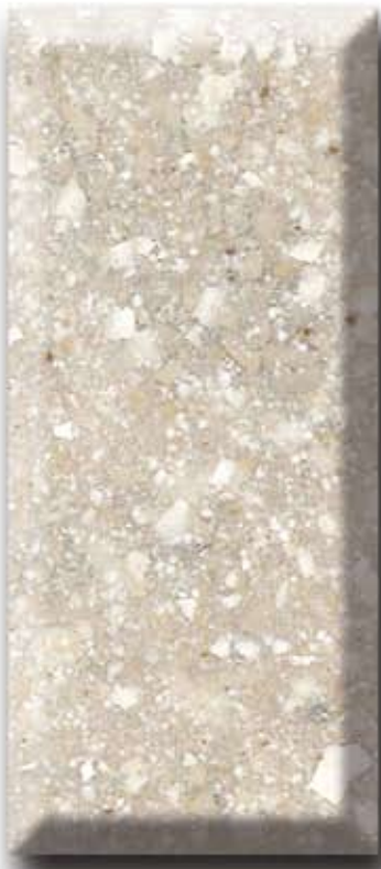
SGE 376 Bahama Sand