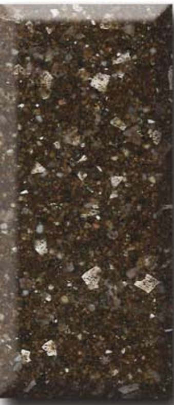
SGE 383 Chocolate Fudge