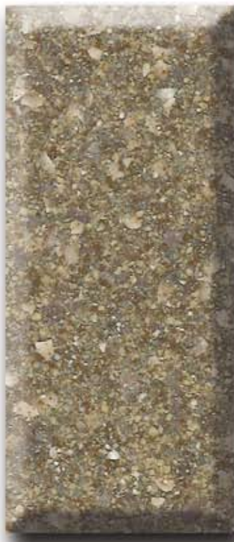
SGE 397 Caramel Corn