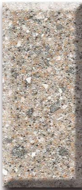
SGE 303 Desert Road NEW!