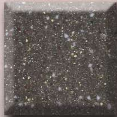
LXS 394 Canyon