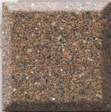
SGL 849 Autumn