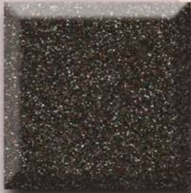
SGA 363 Chestnut