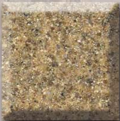
SGL 392 Barley