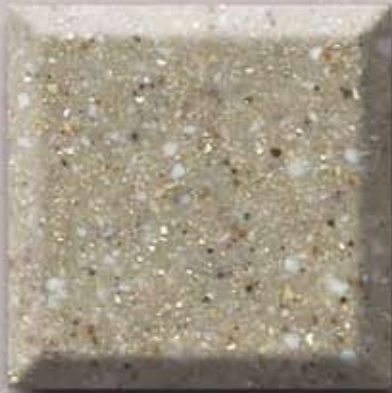
LXS 308 Acorn