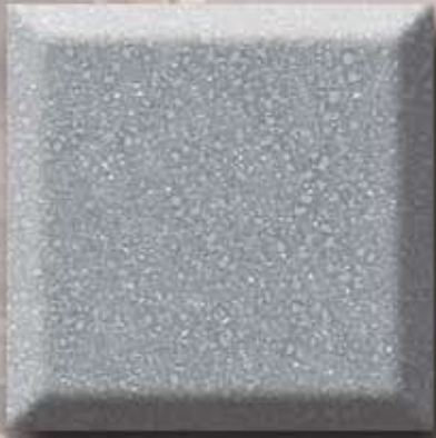
DGE 281 Concrete