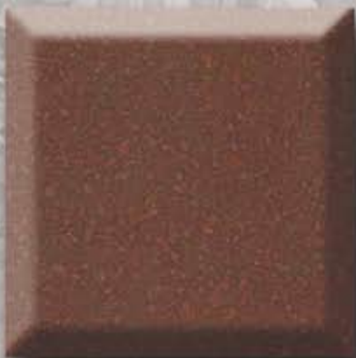
LXS 870 Sedona

With 8 new colors, The R.J. Marshall DGE, LXS and SGA product lines present a variety of colors and textures for outstanding design.