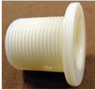
Medium, 1-1/2" #JW500M