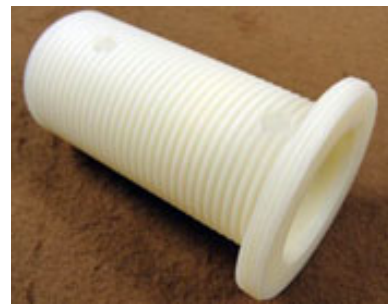
Long, 2-3/4" #JW500L