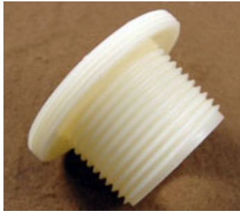
Short, 1" #JW500S

Choose from Short (1" depth), Medium (1-1/2" depth), or Long (2-3/4" depth) wall fittings, depending upon the thickness of your tub.