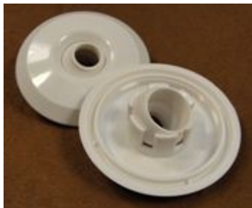
Classic White (CWHT) #JC5090

Other facecaps may be available - call for options: