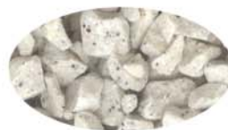
HGS350 Beach (4 mesh)