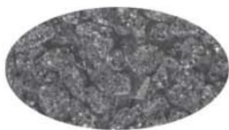
HGS320 Charcoal (4 mesh)

HGS special effect granules are similar to our standard Hylite Granules (HG), except the size is larger (appx. 4mm). Because of the larger size, they also have improved suspension. HGS granules can be added to granite fillers to allow you the option of offering a wider variety of textures. Granite Effect Granules have the effect of smaller particles inside large granules that are designed to be used with granite effect materials. These granules add a distinctive effect when used at levels as low as a 3% to 9% addition to your filler loading.