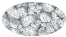
HGS321 Pewter (4 mesh)