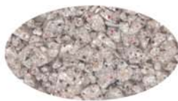
HGS340 Mahogany (4 mesh)