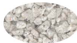
HGS360 Almond (4 mesh)