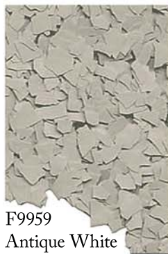
F9959 Antique White