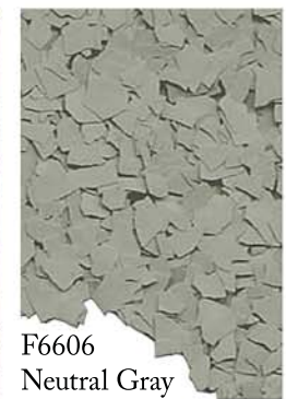
F6606 Neutral Gray