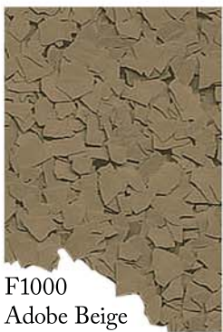
F1000 Adobe Beige

ThinChips are a series of 1/4 th inch random cut, flat, decorative polymer chips that give a large chip look to spray or pour granite effect products. At 4-5 mills thick, ThinChips have the unique ability to soak up resin/gel coat which allows them to become flexible enough to the point of being sprayable. With this flexibility, ThinChips can handle light mixing in a pot mixer without considerable degradation. Add ThinChips in with a cast or spray granite to create a new design. ThinChips are currently featured in SGE and SFHD colors.