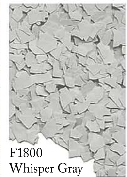
F1800 Whisper Gray