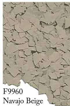
F9960 Navajo Beige