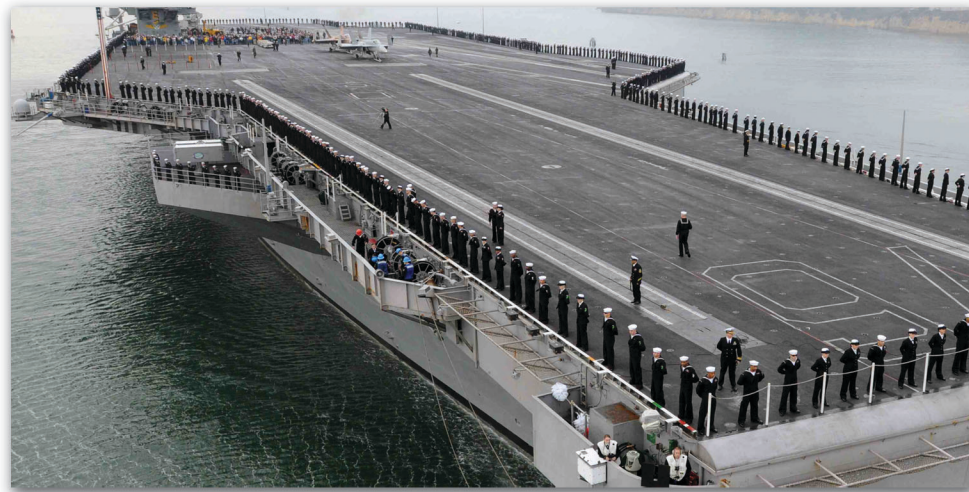
ResNsand Ultra used on the deck of the USS Ronald Reagan

🌿 100% post-industrial recycled material 🌿